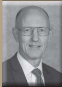
COMMISSIONER Donald J.