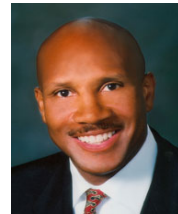
COMMISSIONER Art Graham