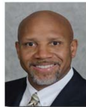
COMMISSIONER Art Graham