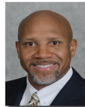
COMMISSIONER Art Graham