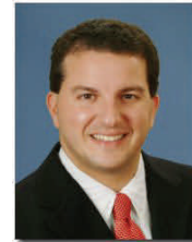
COMMISSIONER Jimmy Patronis