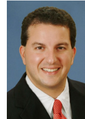
COMMISSIONER Jimmy Patronis