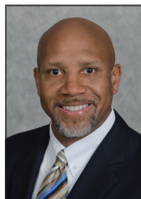
COMMISSIONER Art Graham