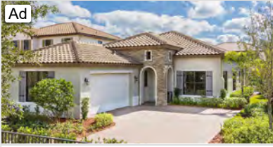
Maple Ridge by CC Homes

FPL Home Services share and use the regulated power company facilities, so there is less overhead.