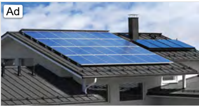
Home Solar Programs

"FPL Home provides Florida consumers with smart, affordable and reliable home services, such as surge protection, smart home security, backup generators, air conditioning filter delivery service and appliance warranties. The company is a subsidiary of NextEra Energy, as is Florida Power & Light, and both entities have separate operations, revenues and expenses. From time to time, FPL Home utilizes resources from other NextEra Energy family companies and compensates those entities for the use of such resources. In the case of a regulated entity like Florida Power & Light, expenditures are monitored and reviewed by the Florida Public Service Commission to ensure ratepayer-funded resources are not supporting non-regulated subsidiaries. To suggest otherwise is simply wrong."