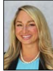
COMMISSIONER Gabriella Passidomo