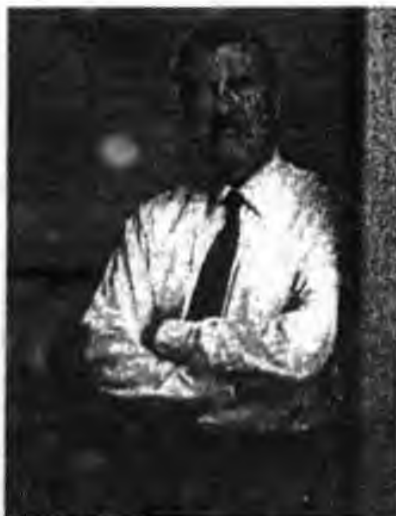
Gerald M. Levin Chairman and Chief Executive Officer

The crowding of so many significant events into a single year shouldn't diminish a sense of their long-term impact. Together, they will help bring superior returns to shareholders. But before we look at these events in more depth, we should also remember that amid the changes, some things stayed the same. First and foremost, the immediate measure of our success continued to be found in the daily decisions of the millions of consumers around the world who turn to our brands and creative output for the best in entertainment and information.