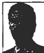
Gerald M. Levin Chairman and CEO