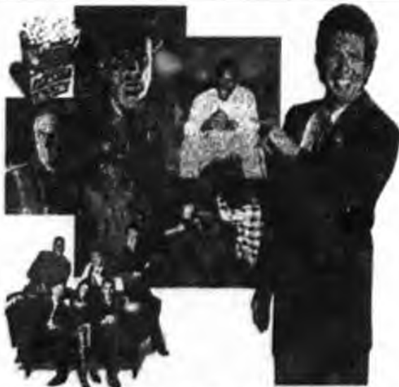
HBO's original programming runs the gamut from drama to comedy to hard-hitting documentaries (clockwise, starting at top): Witch Hunt ;

Among HBO's provocative and critically acclaimed 1994 original films were The Burning Season , State of Emergency , White Mile and Witch Hunt . HBO's probing documentaries, such as Gang War: Bangin' in Little Rock , also won numerous awards and produced in-creasingly strong ratings. The company continued to create a varied slate of family programming, presenting 218 family-oriented shows in 1994. Many featured important social themes and messages, such as Going, Going, Almost Gone! Animals in Danger , presented in association with the World Wildlife Fund. HBO's growing roster of award- winning series includes the "best hour of comedy on TV": the Emmy- and CableACE-winning duo of The Larry Sanders Show , in its fourth season, and Dream On , now in its sixth year. They were joined in 1994 by the irreverent social commentary of the new Emmy-winning Dennis Miller Live . Big-event concerts featured superstars like Barbra Streisand (who headlined the highest-rated music special in HBO history) and Whitney Houston (the first-ever stereo TV transmission from South Africa).