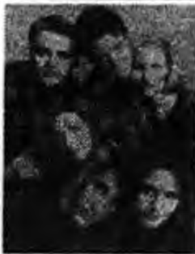
Warner Bros. Television's Friends is the No. 1 new comedy in the 1994-95 primetime season.

Warner Bros. Television continued to supply more primetime television programs than any other company, including the 1994-95 season's No. 1-rated new series and new drama, ER (the highest-rated drama in more than five years, with the highest-rated single episode in two years), and the breakout hit Friends (the No. 1 new comedy series). At year-end Warner Bros. Television had 15 highly rated primetime series on the air, including such longtime favorites as the multiple-award-winning Murphy Brown , as well as Sisters , Step By Step , Family Matters and Full House .