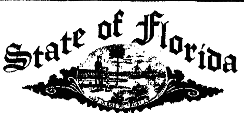
Bepartment of State

I certify the attached is a true and correct copy of the Articles of Incorporation of NTERA, INC., a Florida corporation, filed on April 2, 2001, as shown by the records of this office.