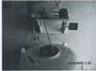
NaOCl Storage and Feed Pumps (Stenner 40 GPD)