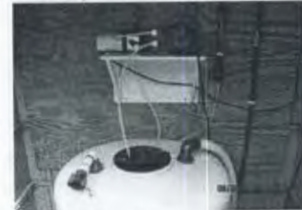
NH 3 Storage and Feed Pumps (Stenner 17 GPD Chem-Tech 15 GPD)