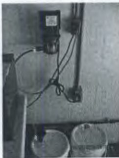
Aquadene at Well 2