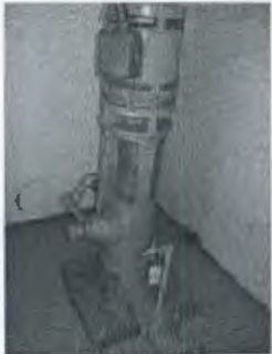
Well 1 - FLUVID# AAB4622