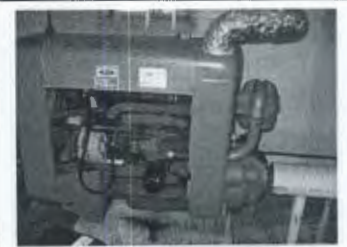
Well 2 - Generator