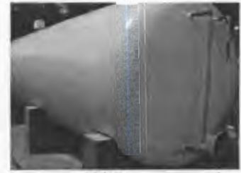
Wells 13/17 - 10,000 gal Hydropneumatic Storage Tank Pressure Gauge