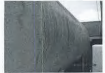
Well 1 - 5000 gal Hydropneumatic Storage Tank