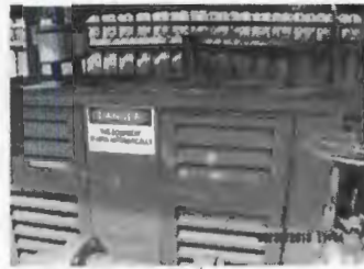
Wells 13/17 - Generator