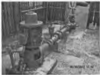
Well 17 - FLUWID# AAB4623