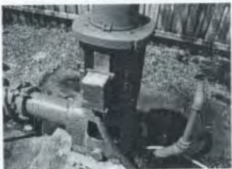
Well 13 - FLUVID# AAB4624