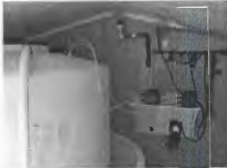
NaOCl Storage and Feed Pumps (Stenner 40 GPD)