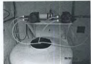
NaOCl Storage and Feed Pumps (Stenner 40 GPD, Chem-Tech 15 GPD (backup))