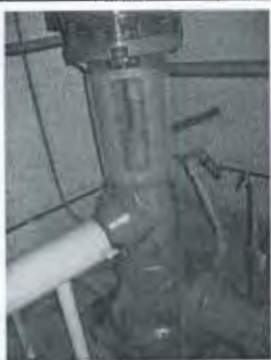
Well 2 - FLUVID# AAB4621