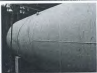
Well 2 - 7500 gal Hydropneumatic Storage Tank