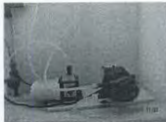
NH 3 Storage and Feed Pumps (Stenner 17 GPD Chem-Tech 15 GPD) Well 1 - Chloramines