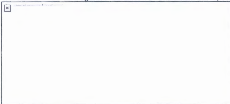
Figure 1: Summer Peak Demand Forecasts (2013 – 2042)

Overall, FPL's base case forecast and risk-adjusted forecast for summer peak demand are is down from those that presented in the FESL proceeding. As illustrated in Figure 1, the base case forecast for summer peak demand in 2017 is 7.4 percent lower than the risk-adjusted forecast and 25.5 3.7 percent lower than the FESL forecast. By 2040, this gap increases to 13.0 percent for the risk-adjusted forecast and 28.4 6.3 percent for the FESL forecast.