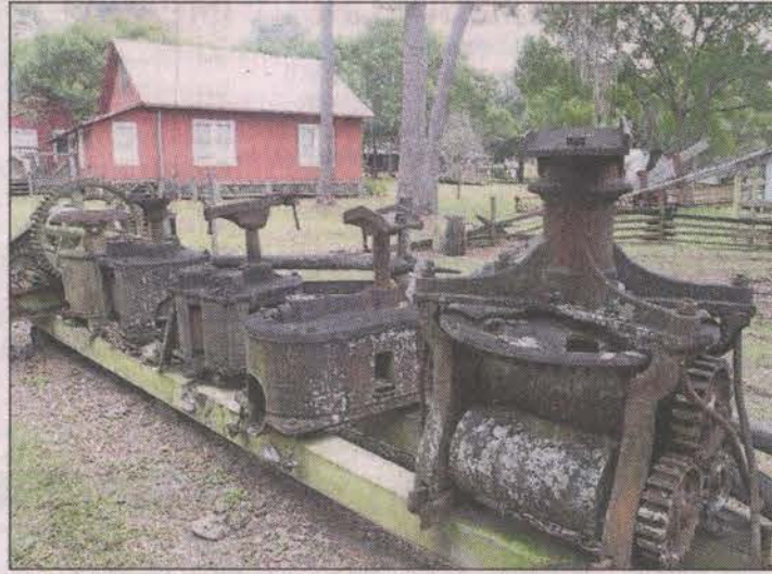
This display of cane mills is part of what's happening at The Syrup Shack. If syrup's not your thing, go for the quilt show, arts and crafts or the Southern draft horse pulling competitions.