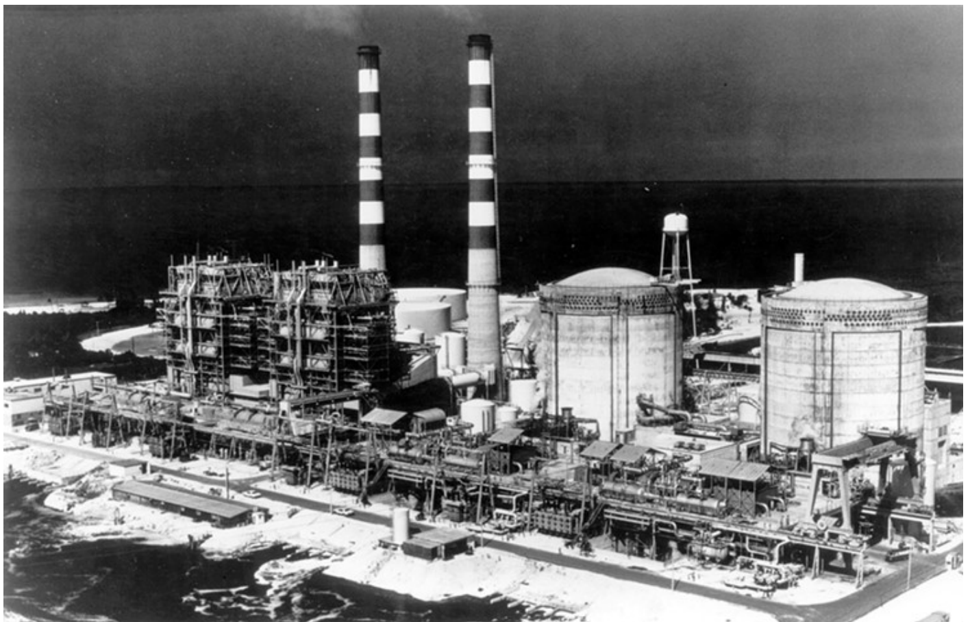
The Turkey Point nuclear power plant in South Miami-Dade, circa 1974.

WEDNESDAY, DECEMBER 7, 2016 AT 11:07 A.M.