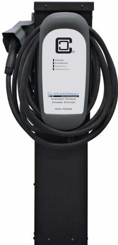
PMD-10R with HCS -60

The PMD-10R is an affordable solution designed for fleet, parking lot, or any harsh environment. Designed to accommodate ClipperCreek HCS, LCS, ACS products as well as the Tesla® Wall Connector. This "ruggedized" mounting solution is an excellent value at $695 .