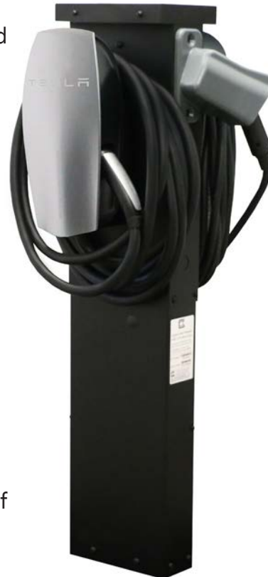
HCS/TESLA® Combo PMD-10T

The PMD-10T has all the same features as the PMD-10, but comes equipped to mount ClipperCreek and/or Tesla® charging stations. Available for just $434