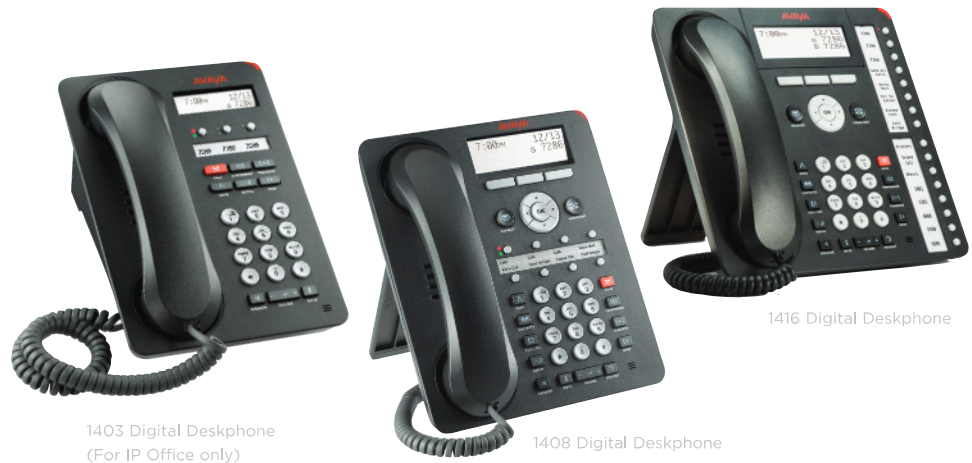
1403 Digital Deskphone (For IP Office only)