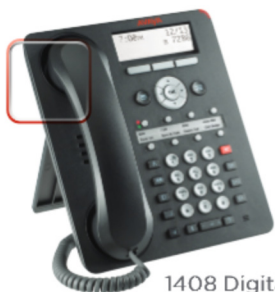
1408 Digital Deskphone

To learn more about the 1400 Series Digital Deskphones, contact your Avaya Account Manager, Avaya Authorized partner or visit avaya.com for white papers, case studies and other information showcasing Avaya solutions in action.