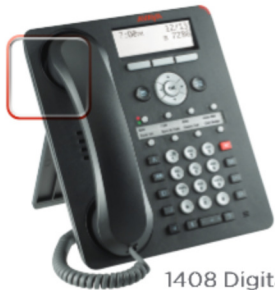
1408 Digital Deskphone

To learn more about the 1400 Series Digital Deskphones, contact your Avaya Account Manager, Avaya Authorized partner or visit avaya.com for white papers, case studies and other information showcasing Avaya solutions in action.