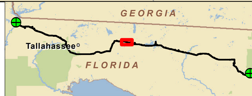
FIGURE 2 ROAD MAP JEFFERSON COUNTY