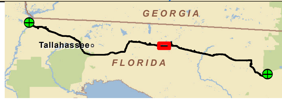
FIGURE 2 ROAD MAP MADISON COUNTY SCALE: 1 in = 2,000 feet DATE: 5/21/2020 8:37:34 AM DRAWN BY: unash FILE NAME: NFRC_GeoTechRoadMA