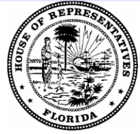
CHRIS SPROWLS Speaker of the House of Representatives

EMAIL: OPC_WEBSITE@LEG.STATE.FL.US WWW.FLORIDAOPC.GOV