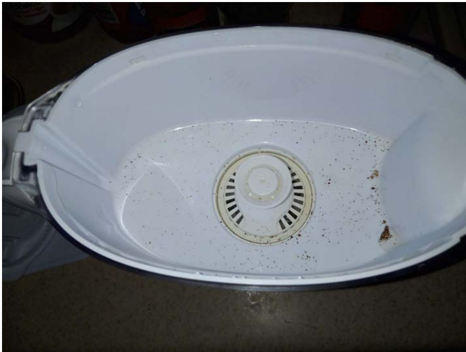
Picture 1. A Week of Residue in Water Filter

The matter of lack of filtering at the plant level is pronounced in the Picture 1. Which shows one week of filtering at home for about 4.5 Gallons.