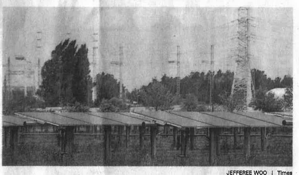
A solar farm at the TECO Big Bend Power Station in Apollo Beach. The Florida Public Service Commission has more power over your life than you may realize.

consultant. For local Duke customers, it's been 15 years.