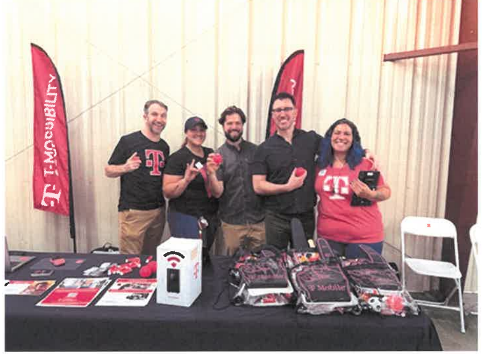
Florida ASL Festival, Kissimmee, Florida June 2024