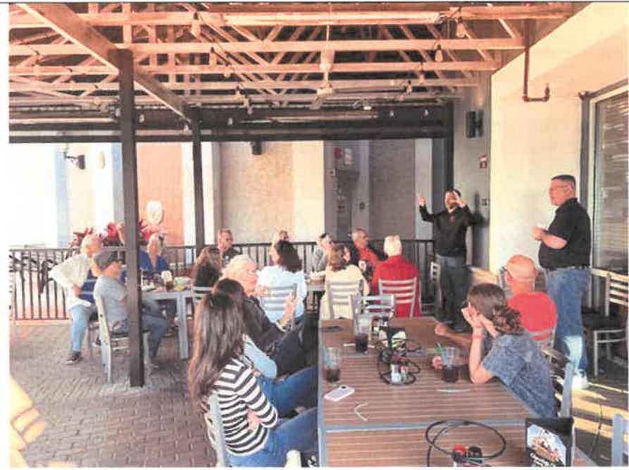
Road Tour, St. Augustine, Florida 2024