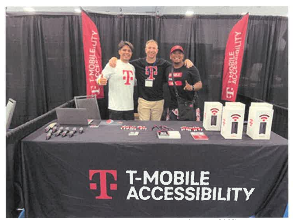
It's a Deaf Thing Event, Lakeland, FL October 2023