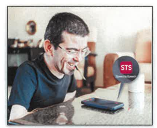
Speech-to-Speech User easily tapping the STS Shortcut Icon to make an STS call

The Florida Relay AE will promote and share information about a new exciting feature called "Speech-to-Speech Shortcut Icon" for the STS users. The STS user simply adds the STS Shortcut Icon on their wireless device's home screen and quickly taps it whenever they are ready to make an STS call. This STS shortcut icon is designed to automatically dial the phone number for the STS service. The shortcut icon uses virtually no space on their wireless device and makes STS that much more convenient. This feature also supports STS callers who have mobility challenges by simply clicking the icon instead of entering a phone number. This feature is available for both iOS and Android phones.