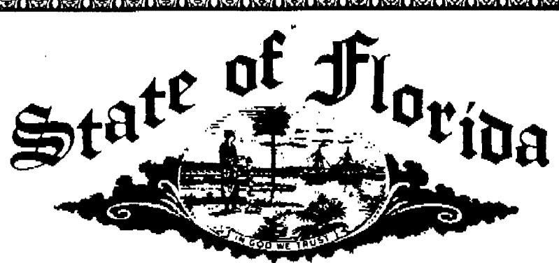
Department of State

I certify that the attached is a true and correct copy of the Application For Registration of Fictitious Name of RING MY BELL PAY PHONES, registered with the Department of State on May 27, 1999, as shown by the records of this office.