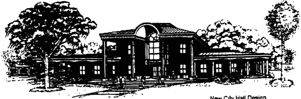
New City Hall Design

Area Code: 382 SUNCOM Prefix: 668 ZIP Code: 34705