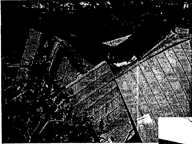
Broward Co. Remote Terminal

1 2 3 4 5 6 7 8 9 10 11 12 13 14 15 16 17 18 19 20 21 22 23 24 25 26 27 28 29 30 31