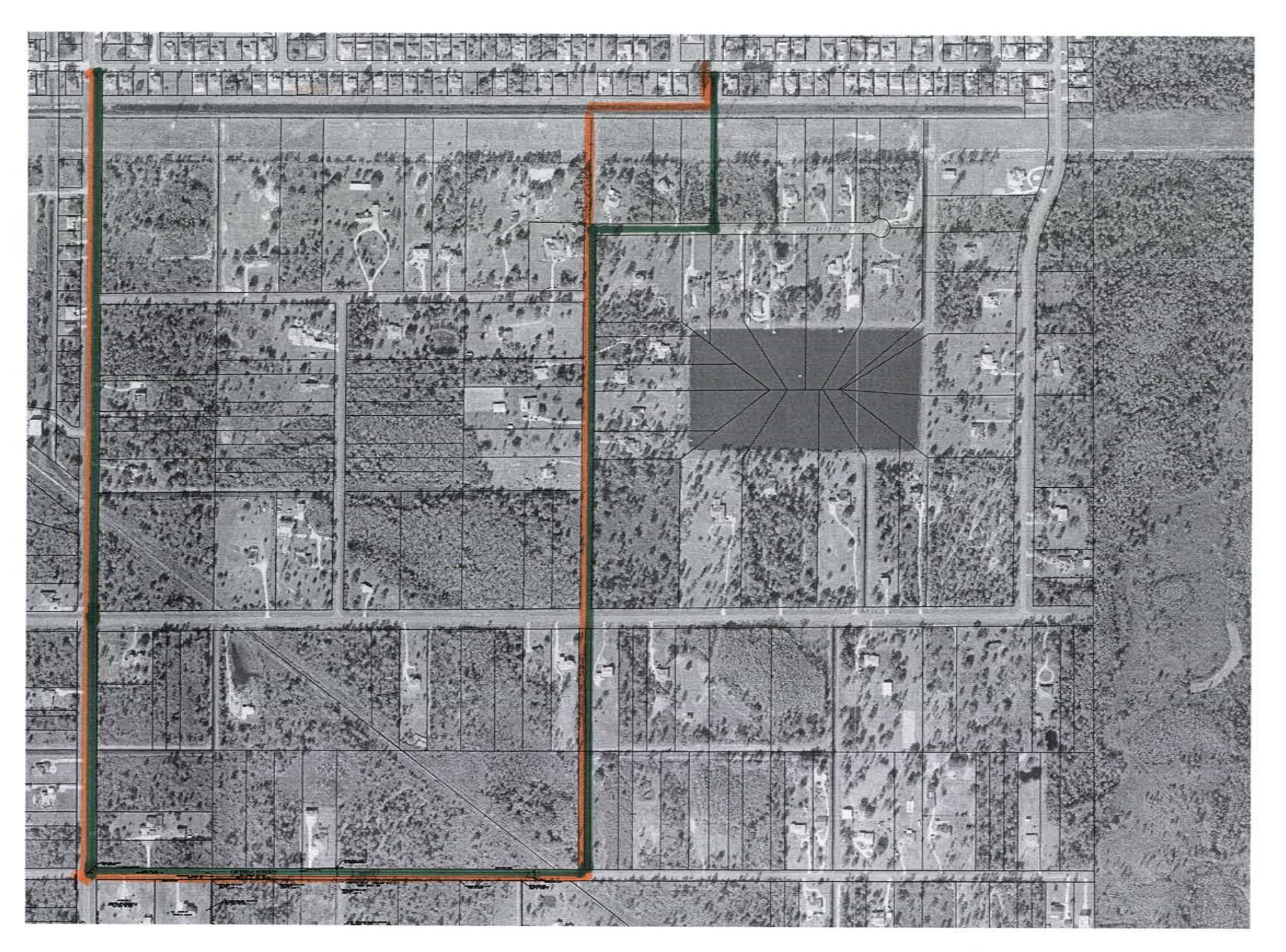
WHER MAINS - TWO ALTERATIVES