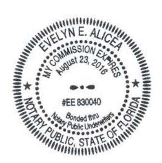
Print Name NOTARY PUBLIC My Commission Expires: