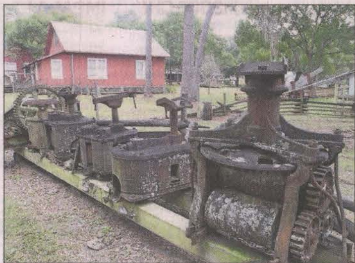
This display of cane mills is part of what's happening at The Syrup Shack. If syrup's not your thing, go for the quilt show, arts and crafts or the Southern draft horse pulling competitions.