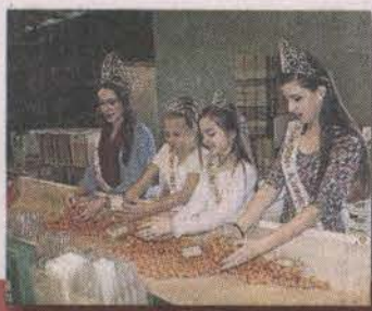
KUMQUAT ROYALTY: Girls in tiaras enjoy Dade City festival. Page 3