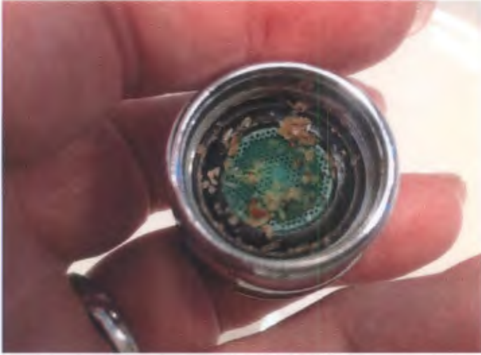
Photo taken on 9/10/16 – Ann Marie Ryan’s master bath faucets – Sediment and Biofilm Residue