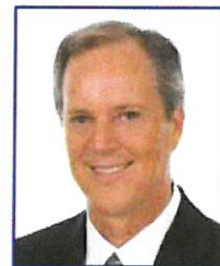
Beam Furr Broward County Commissioner