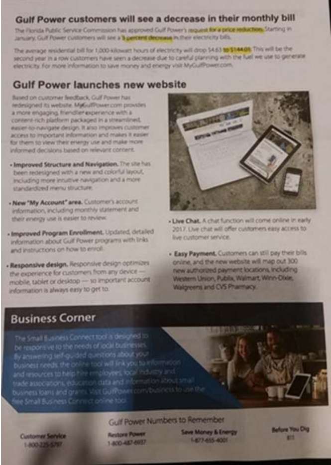
No information about the increase is on their website either https://www.gulfpower.com/residential/savings-and-energy/rates-and-billing .