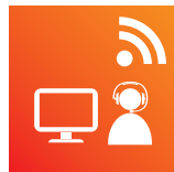
Communication & Management