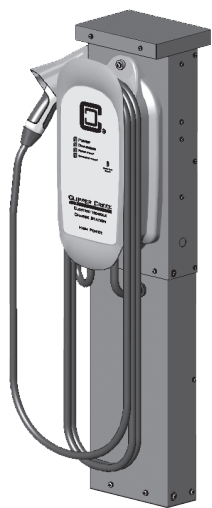
Single ClipperCreek HCS EVSE