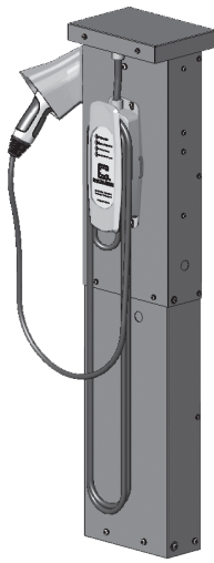
Single ClipperCreek LCS/ACS EVSE