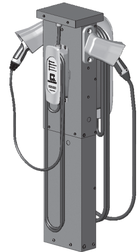
Combo ClipperCreek HCS and LCS/ACS EVSE