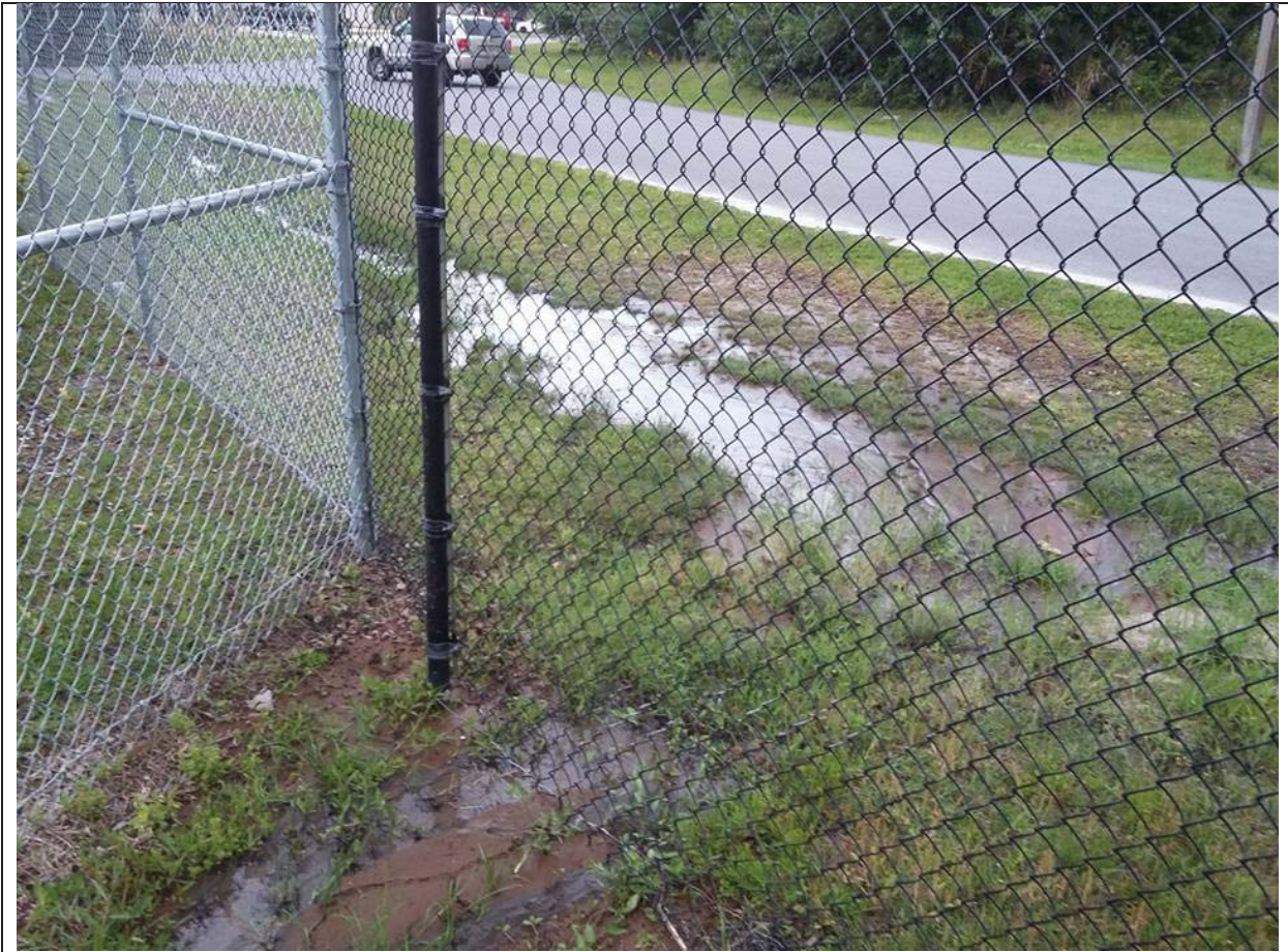
Photo 10 - Pluris water plant, draining from park to street.