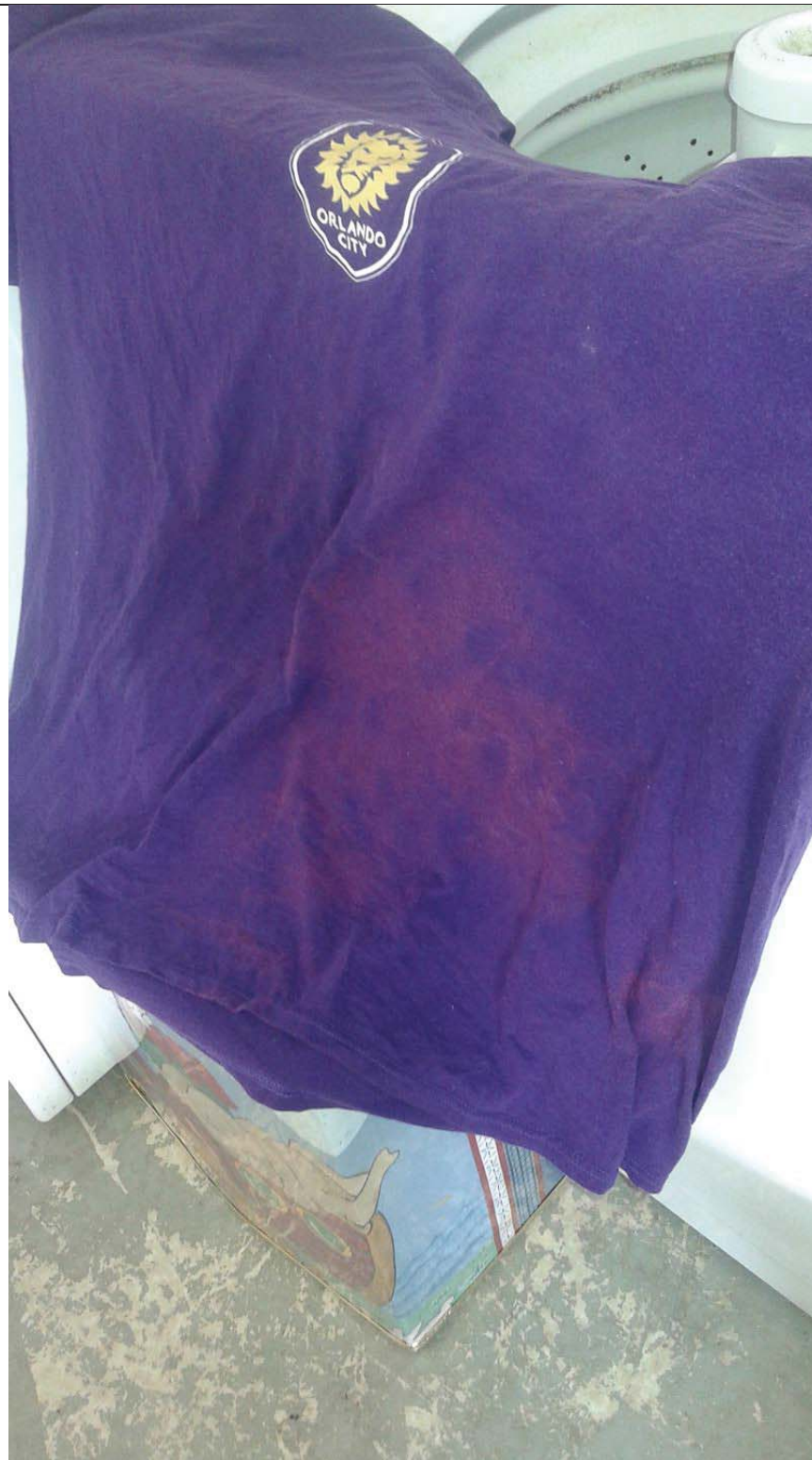
Photo 7 - Bleached clothing after FDEP approval of Chlorine Dioxide (ClO 2 ) use in Pluris water.