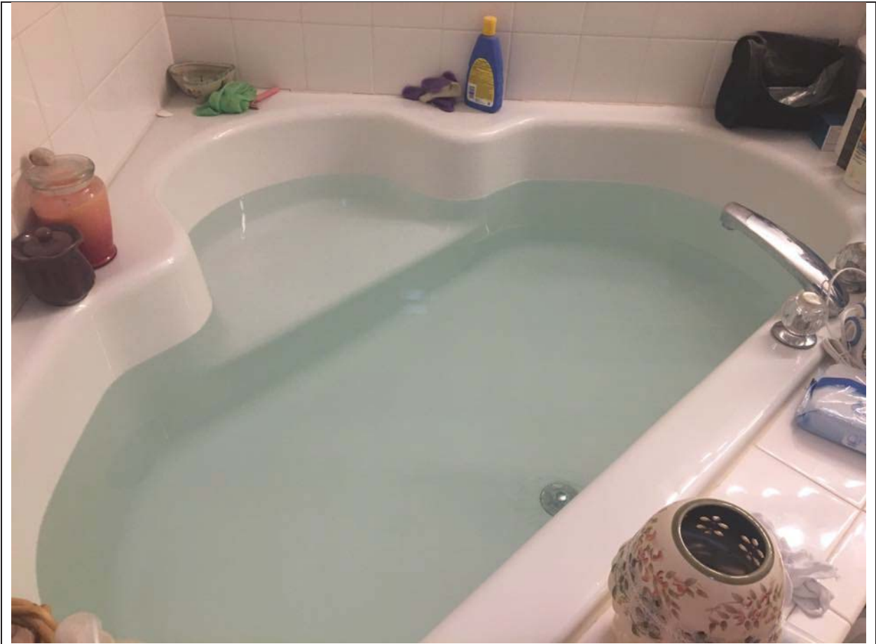
Photo 11 - Blue Pluris water