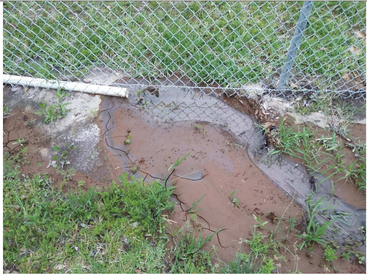
Photo 9 - Pluris water plant, draining into Wedgefield park.