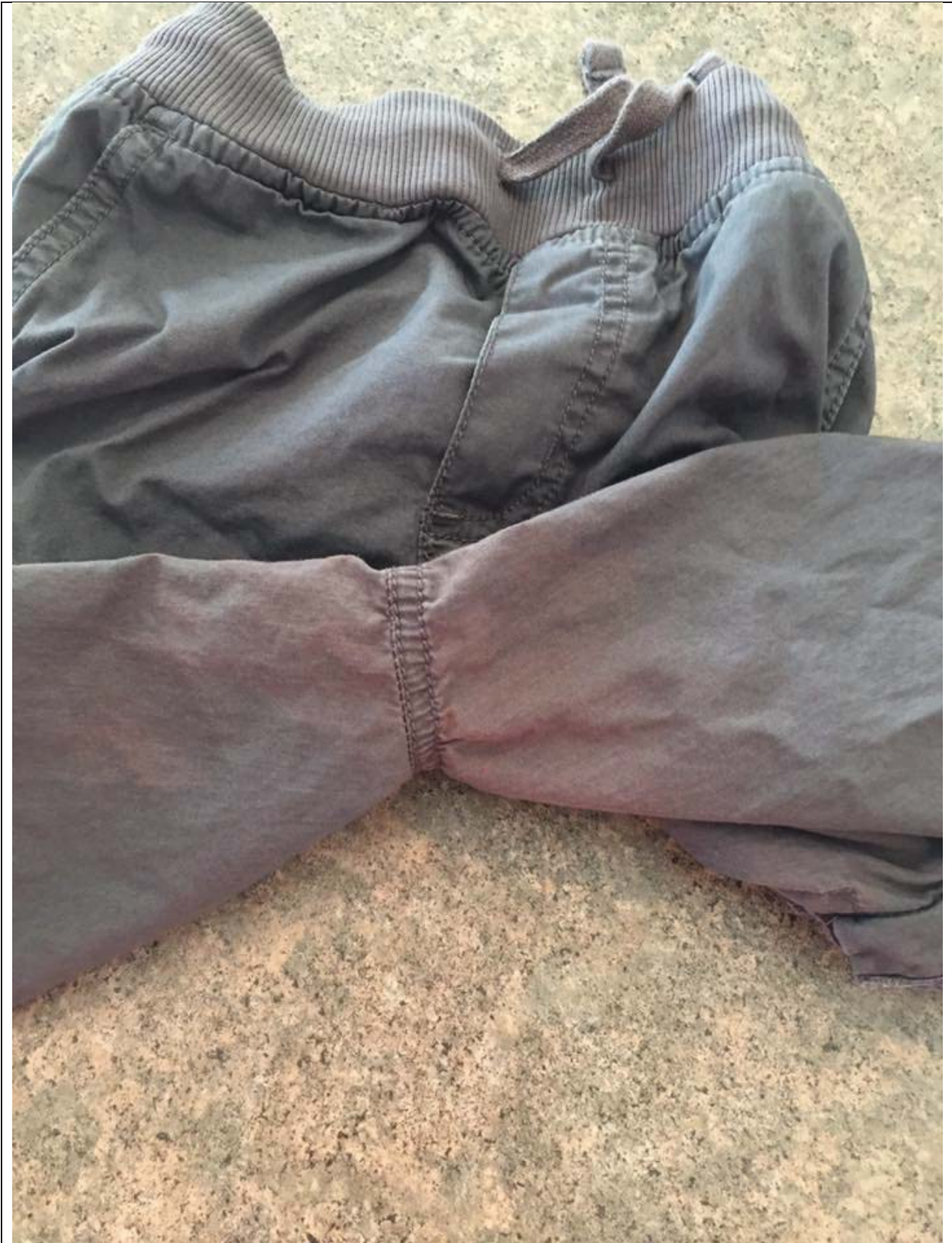
Photo 8 - Bleached clothing after FDEP approval of Chlorine Dioxide (CLO 2 ) use in Pluris water.