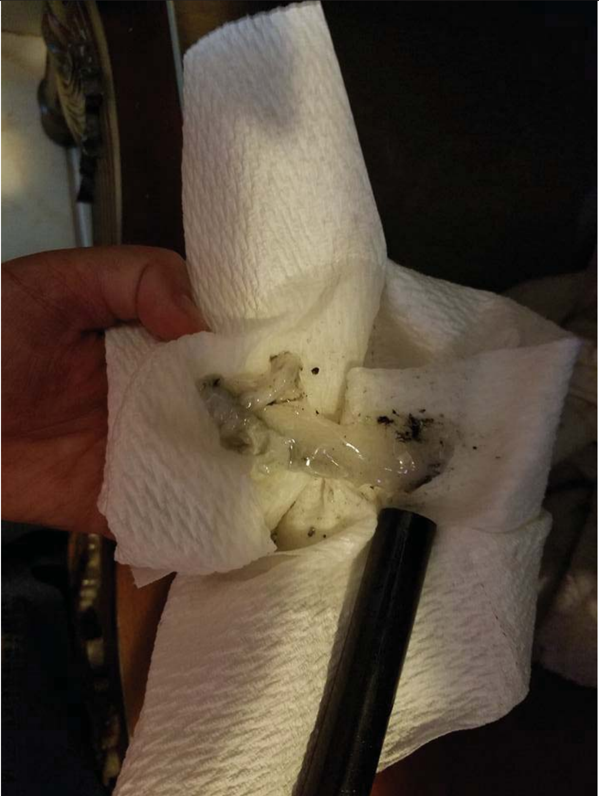
Photo 6 - Algae buildup in water line and drain.