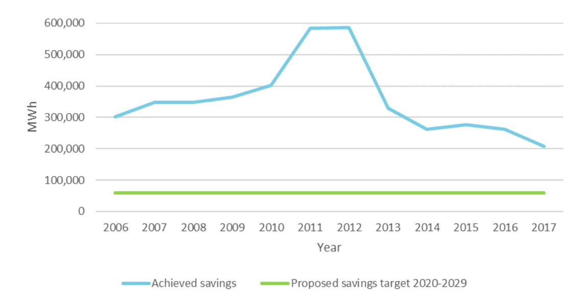
Aggregate savings proposed by FEECA utilities (green) as compared to achieved savings in past years (blue).

Significant energy savings opportunities remain in Florida. Utilities in neighboring states have shown that achieving much higher levels of savings is possible. For example, Duke Energy Carolinas (North Carolina) and Entergy Arkansas, Inc. saved 0.93% and 1.79% of 2017 annual retail sales, respectively.<sup>6</sup> Moreover, in 2017 thirteen states saved at least 1% of retail electricity sales through energy efficiency programs.<sup>7</sup> These utilities are investing in a range of programs targeting different customer segments and end-uses, including high-efficiency appliances and consumer electronics, custom programs for large energy users, and mid-stream programs that deliver savings to customers at the point of purchase.<sup>8</sup> In nearly all cases, these high savings are driven by ambitious but achievable goals set by regulators.