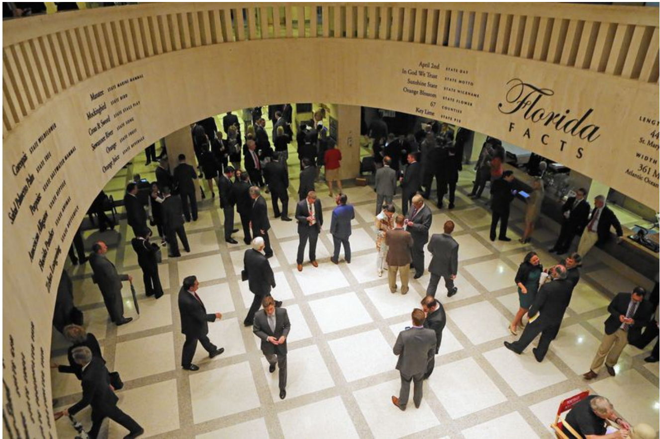
Lobbyists work in the rotunda between the Florida House and Senate chambers.

Florida Power & Light Co. is on track to spend as much as $1 million this year to lobby lawmakers, regulators and state leaders, a situation that critics say could make customers the losers.