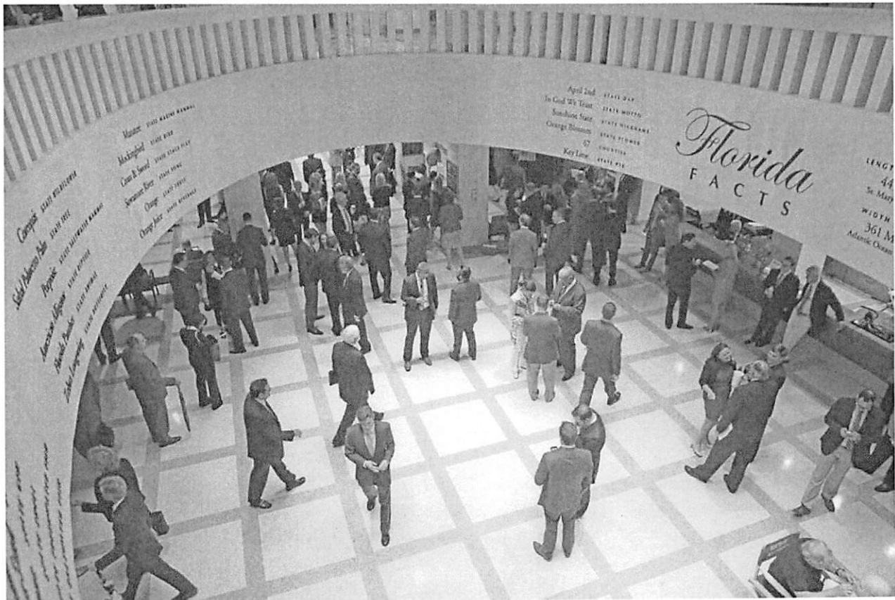
Lobbyists work in the rotunda between the Florida House and Senate chambers.

Florida Power & Light Co. is on track to spend as much as $1 million this year to lobby lawmakers, regulators and state leaders, a situation that critics say could make customers the losers.