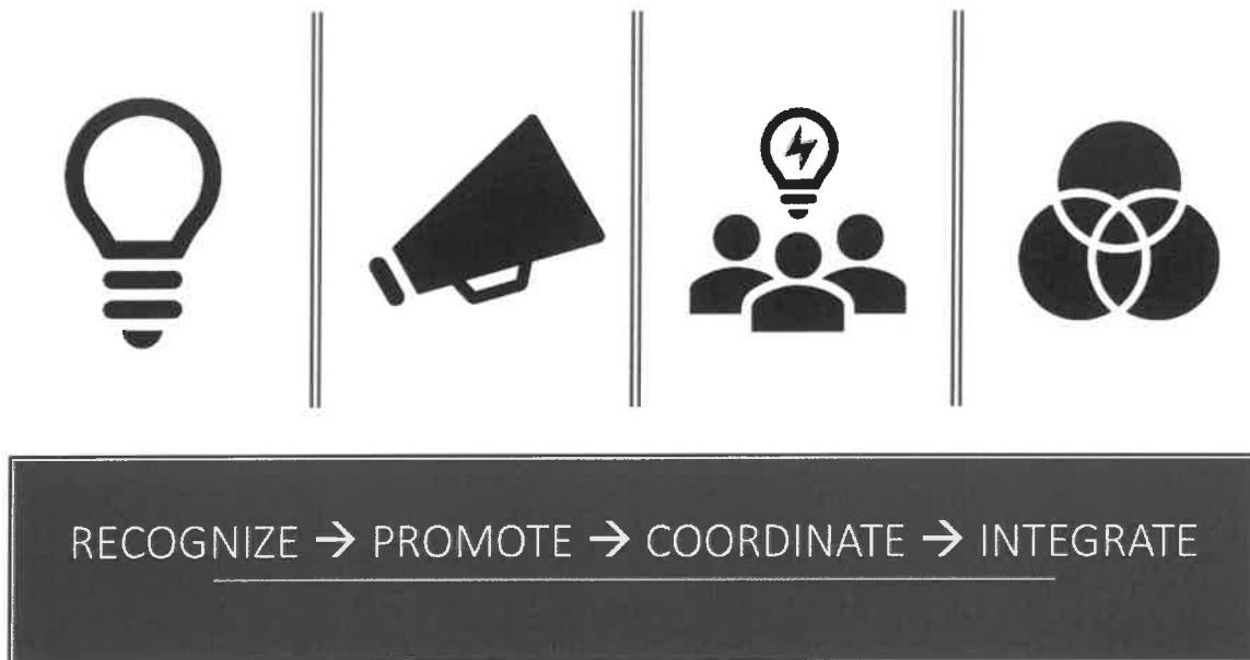
Figure 2. Levels of program integration

Additionally, while they have not established specific programs, the California utilities and Oklahoma Gas & Electric (OG&E) have all conducted research on the benefits of and new approaches to integration. OG&E, for example, studied the cost efficiencies involved in low-income and multifamily energy storage systems acting as an energy efficiency measure and participating in DR programs.