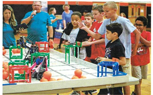
Fruitland Park Elementary Robotics Scrimmage Lake County