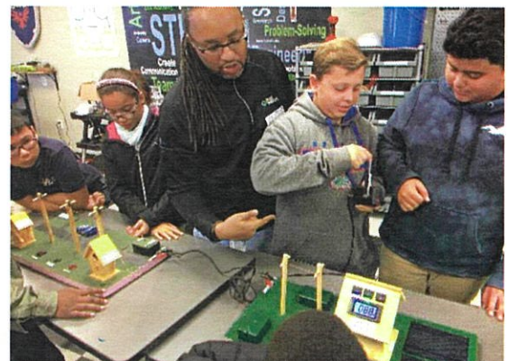
Edward W Bok Technology & Engineering Education Polk County