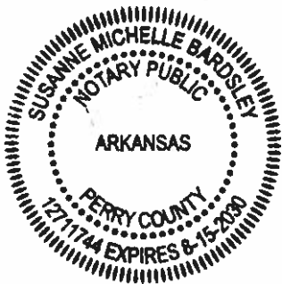
_____ - Notary Public

Personally Known _____ Produced Identification _____ Type of Identification Produced _____