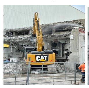
Building Demolition & Firing Range Closure