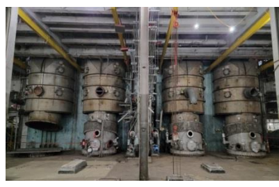
Turbine, Auxiliary & Diesel Generator Building