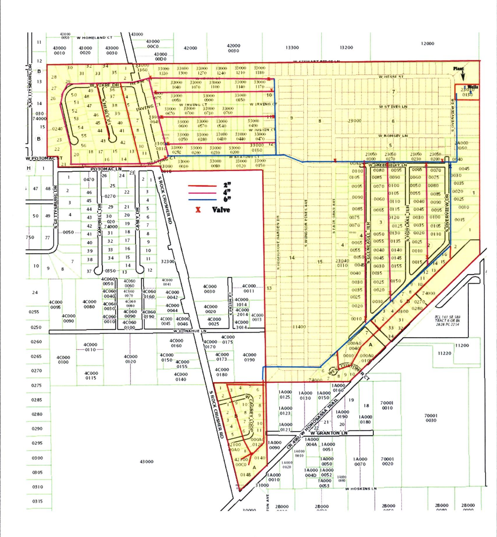
Exhibit D - System Map with Lines and Treatment Facility Avalon Hills Water System PWSID 609-4773 Grandfather Certificate Application Hash Utilities, LLC