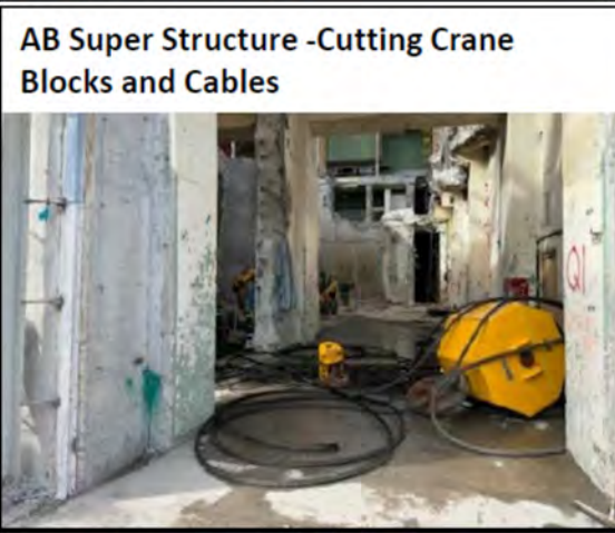
AB Super Structure -Cutting Crane Blocks and Cables