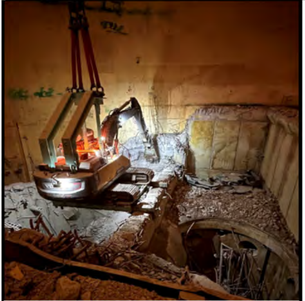
RB Phase 2 Internal Demo