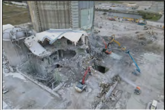
AB Super Structure Demo