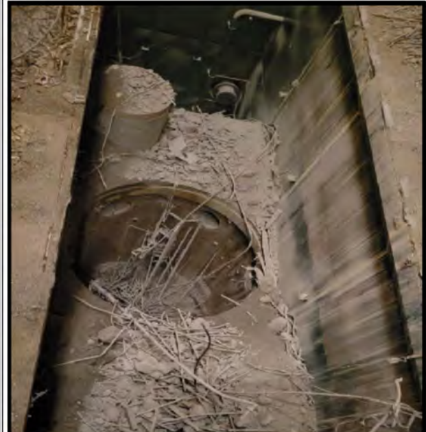
RB Phase 2 Internal Demo