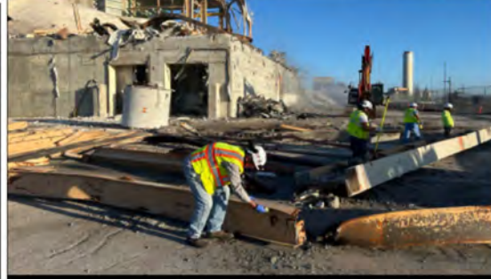
AB Super Structure Demo – RP Survey