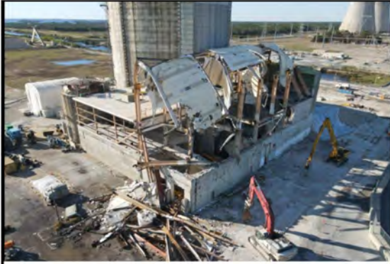
AB Super Structure Demo