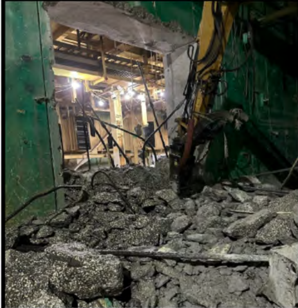
RB D-Ring Wall Opening