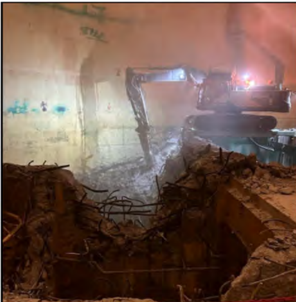
RB Phase 2 Internal Demo