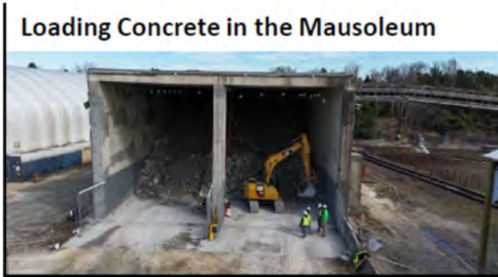
Loading Concrete in the Mausoleum