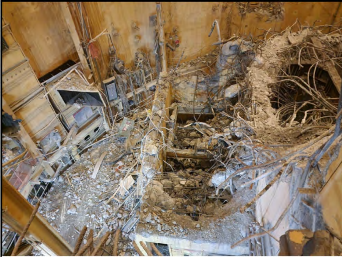
RB Phase 2 Internal Demo