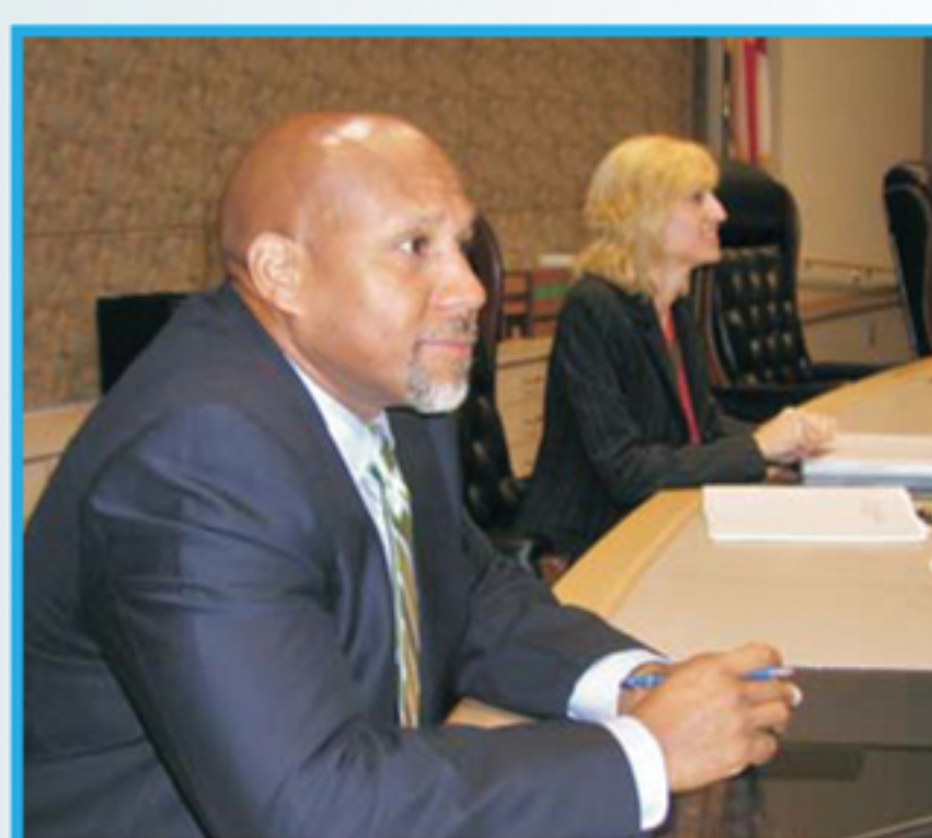
PSC Commissioners listening to customer testimony