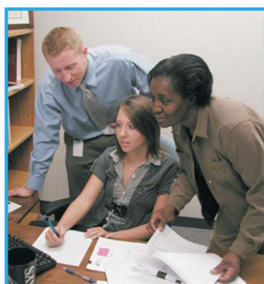
PSC accountants checking numbers in the utility's filing requirements