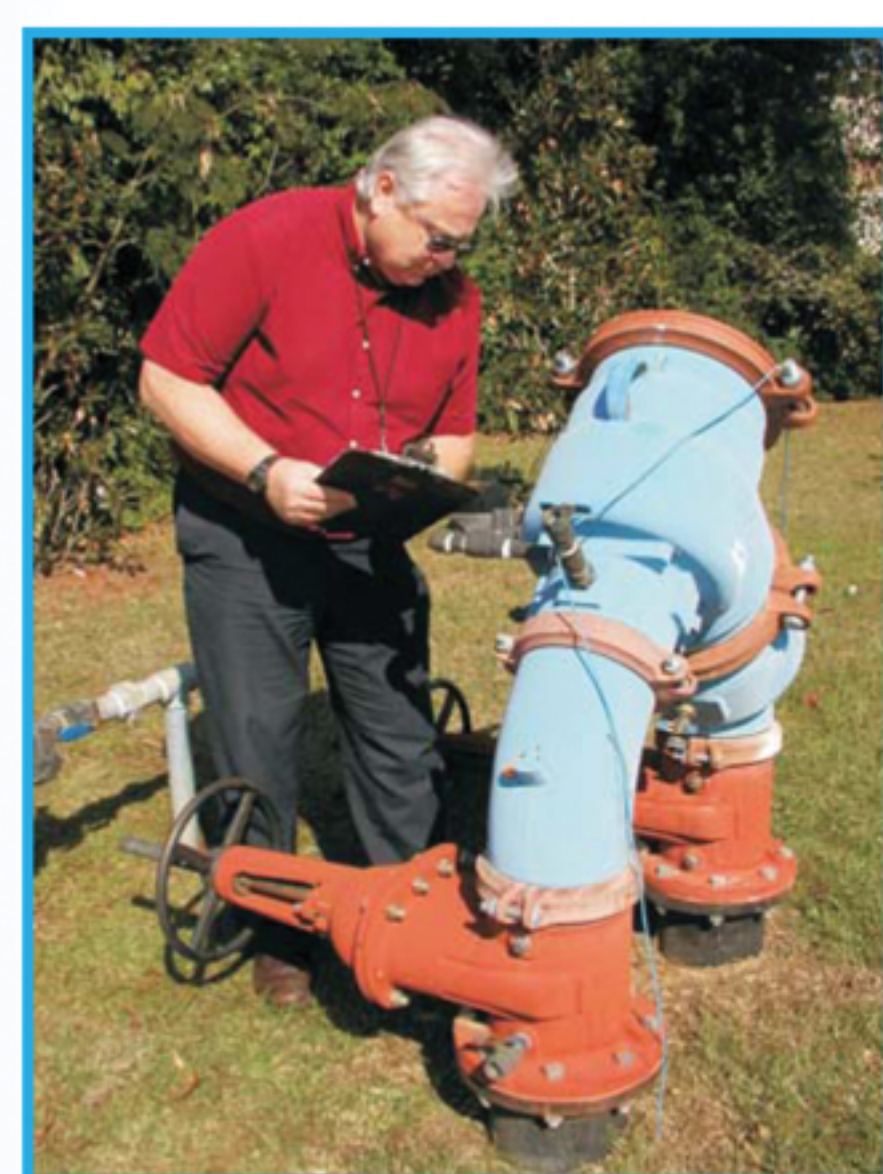
PSC engineer in the field