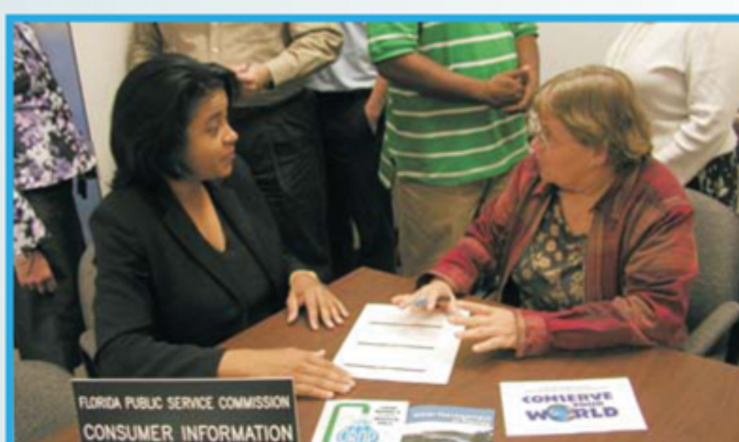
PSC staff gathering information at a customer meeting