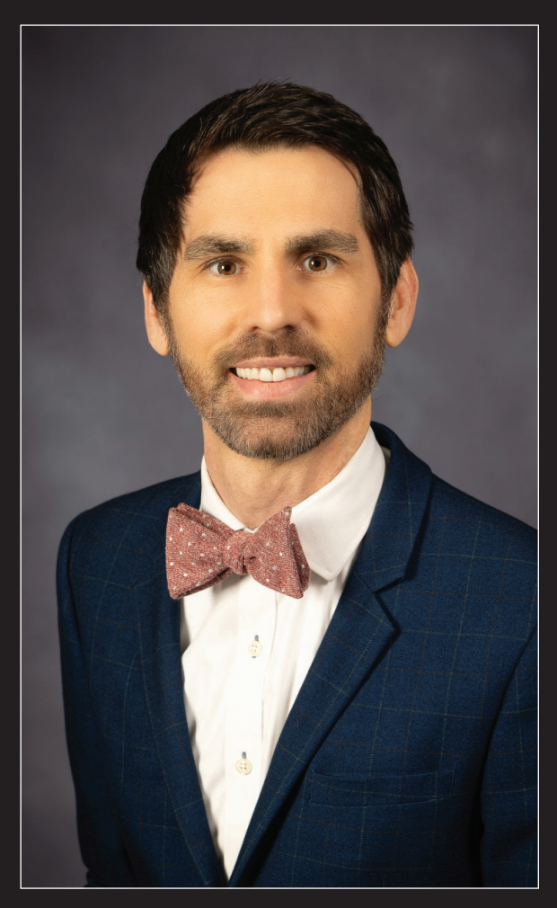
FPSC Commissioner Andrew Fay

Panelists included experts from the Department of Energy's state, local, tribal, and territorial (SLTT) governments program; DOE's Energy Threat Analysis Center (ETAC); utility broadband security professional; and a creator of digital power system products. All participants agreed that cyber threats to utility infrastructure continue to grow as do the potential impacts of a successful attack. The panel offered insights into viable mitigation strategies and the regulator's role in information sharing.