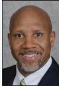
COMMISSIONER Art Graham