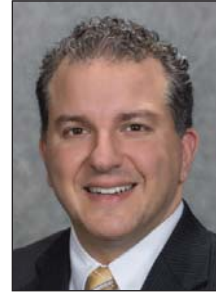
COMMISSIONER Jimmy Patronis