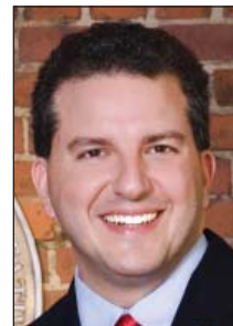
COMMISSIONER Jimmy Patronis