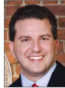
COMMISSIONER Jimmy Patronis